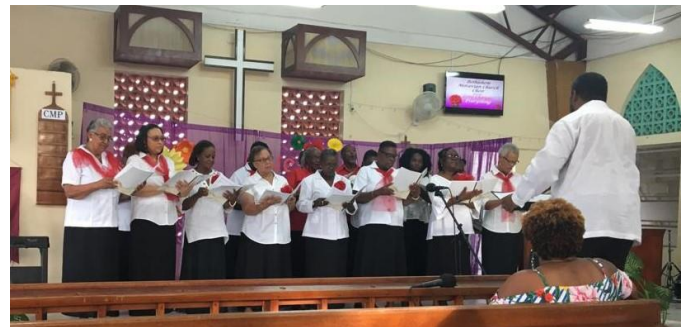
Above: Our Choir & Director during one of the performances

The Choir hosted a Concert under the theme “ LOVE CHANGES EVERYTHING ”.